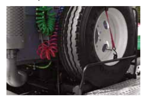
Spare Tire Carriers