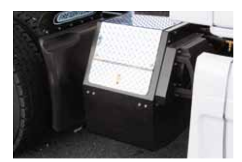
Auxiliary Power Units

Minor modifications, custom work or standard installations, PDI Centers' extensive list of special services help fleets put trucks into service efficiently. And, there's never a charge for the initial predelivery inspection.