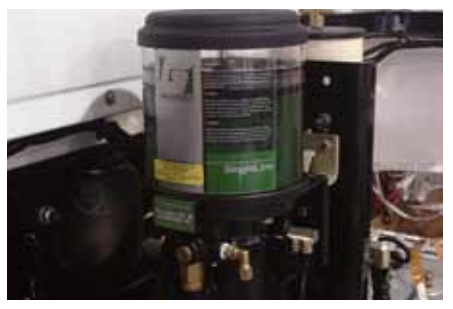
Auto Lube Systems