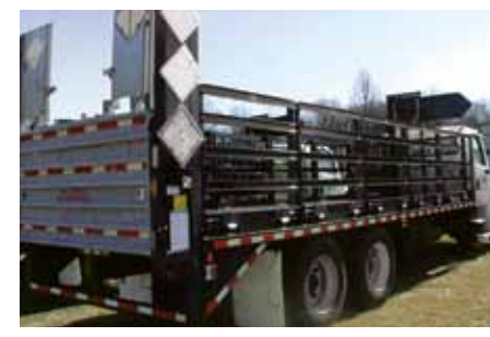
Body Placards and Markings