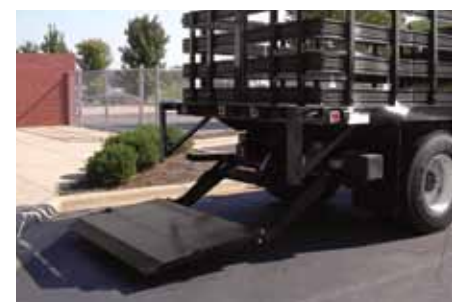
Lift Gates and Rail Lifts