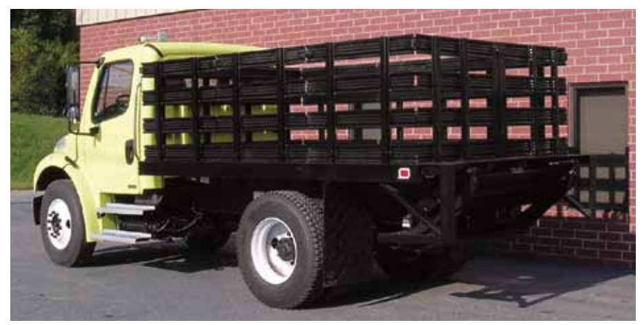
Stake Body Installations