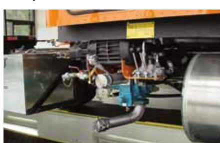
PTO Fluid Pumps