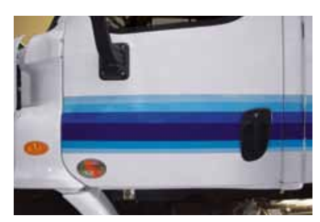
Fleet Graphic Applications