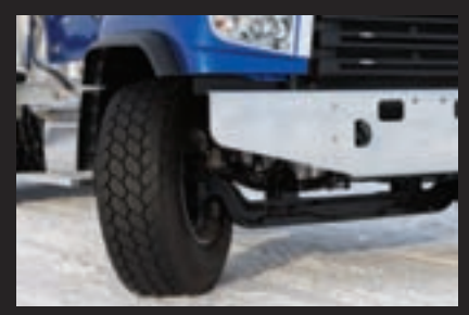
Up to 45 degree wheel cut depending on wheel equipment.