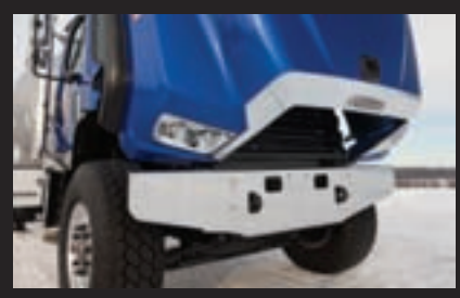
Tilt hood with radiator-mounted stationary grille and bridge formula front bumper.