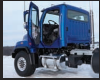
Ease of entry/exit and clear back of cab packaging.