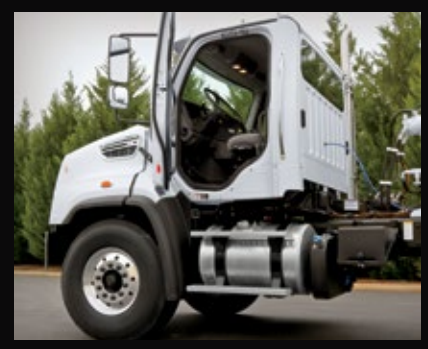
65 degree door opening for ease of entry/exit.