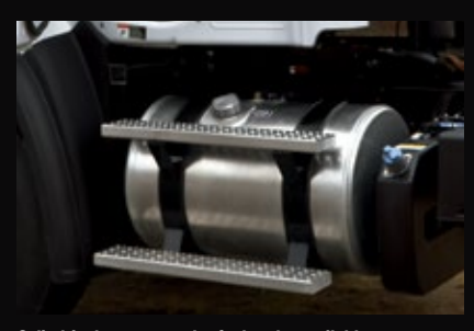
Cylindrical or rectangular fuel tanks available.