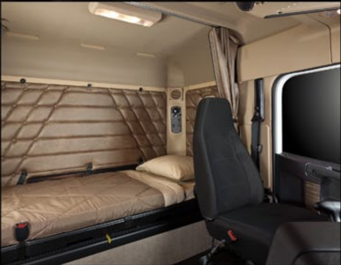
122SD 48" Mid-roof Sleeper