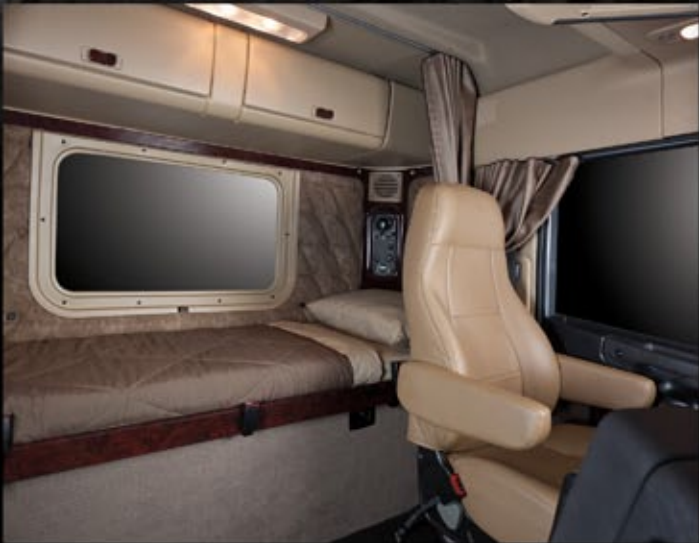
122SD 34" Mid-roof Sleeper