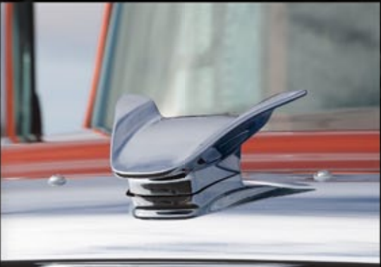
Signature chromed hood handle.