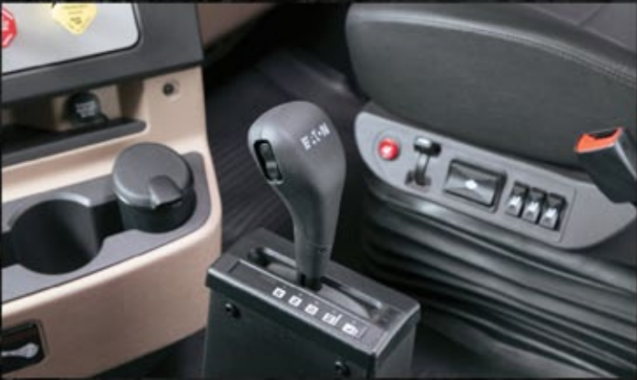
Eaton Cobra shifter for optional automated manual transmission.