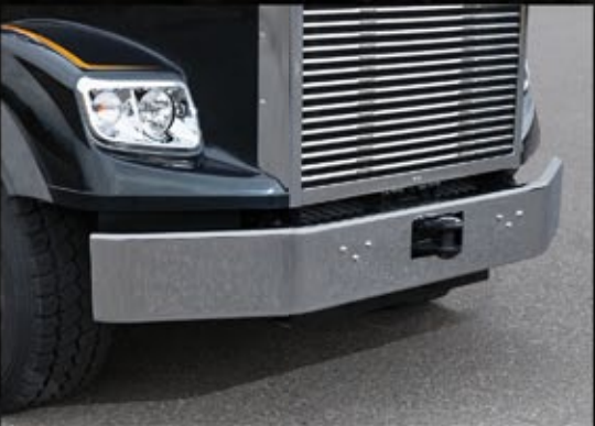
Optional chrome logger bumper.