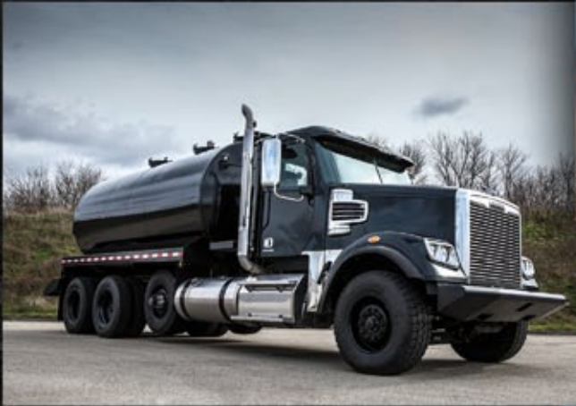
122SD Water Tanker