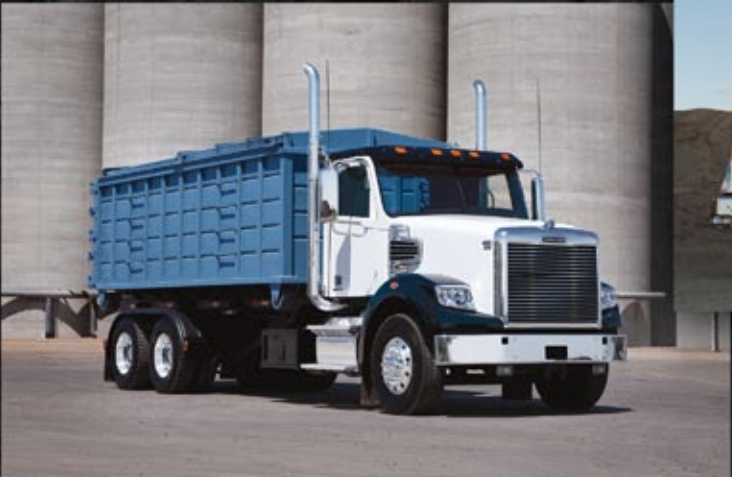
122SD Roll Off