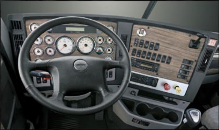
Standard interior trim features Bandon Driftwood dash and accents.