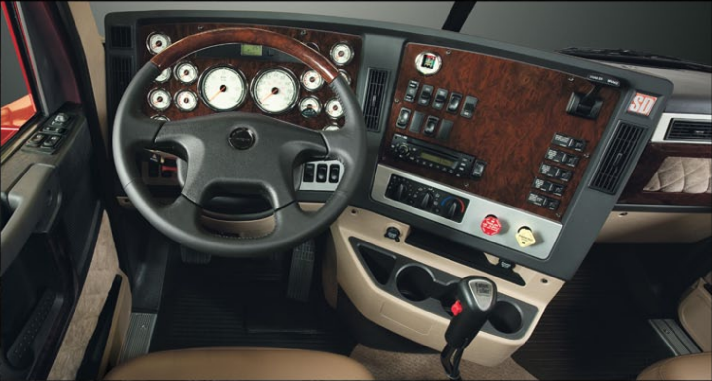
Optional interior trim features Signature Oregon Burl Wood dash and accents.