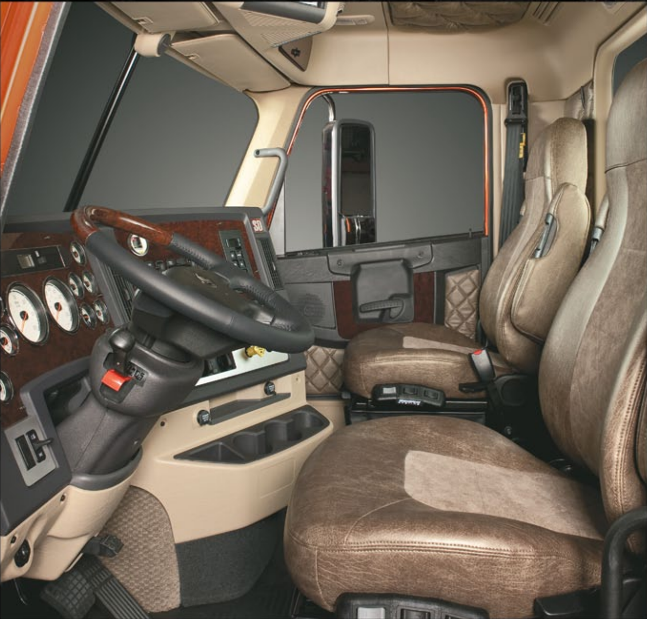
Large opening for easy driver entry/egress.

air bag. The curved, two-piece windshield makes it easier to spot and avoid potential hazards. And the exterior mirrors have been repositioned for even better visibility. The driver's side now has an optional grab handle for easier and safer entry. The filtered HVAC offers superior airflow and climate control, keeping temperatures more consistent and reducing driver fatigue. Freightliner offers an optional Extreme Climate Thermal package for even greater insulation and comfort.