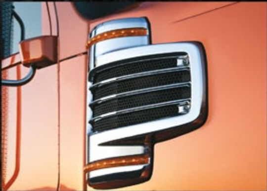
Dual hood-mounted air intakes. Chromed steel finish optional.

The 122SD exterior is ideal for Truck Equipment Manufacturers. Clear back-of-cab packaging options enable easier configuration, reducing body installation time. Specifically, Freightliner has provided clear frame rails, multiple exhaust options, a robust electrical system, three DEF tank sizes and several fuel tank and hydraulic reservoir mounting options.