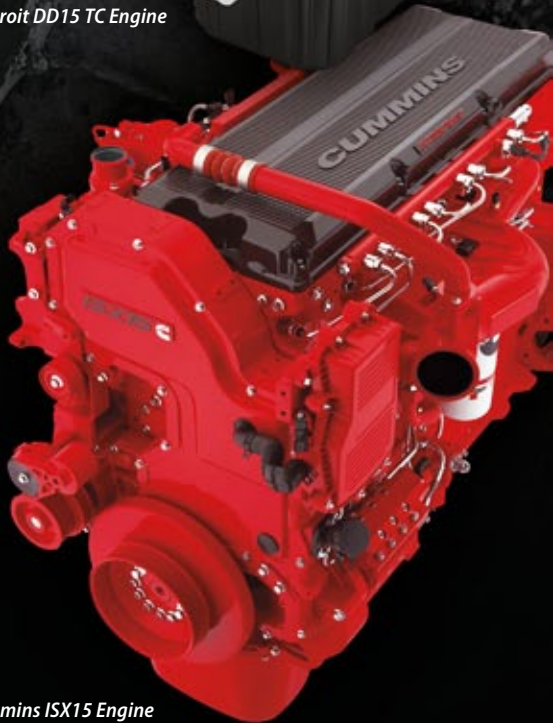
Cummins ISX15 Engine