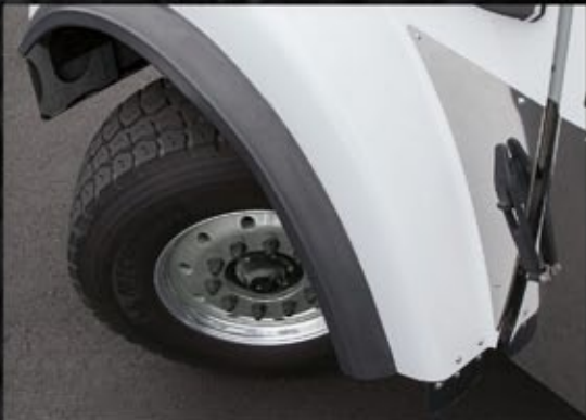
Up to 50-degree wheel cut.